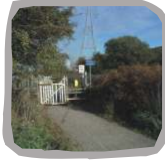
Path over railway line (Waymarker 7)