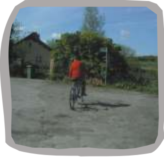
Bridleway at end of Flass Lane (Waymarker 3)