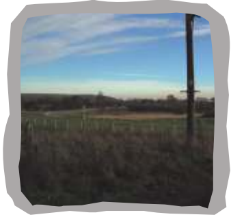
Pontefract Race Course (Waymarker 6)