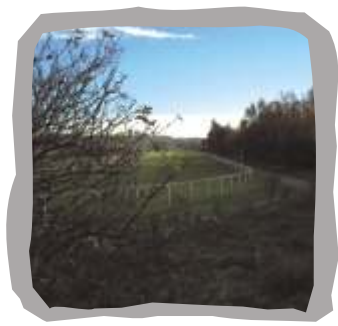
Pontefract Race Course