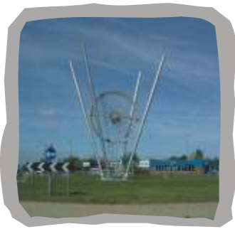
Colorado Way roundabout (Waymarker 1)