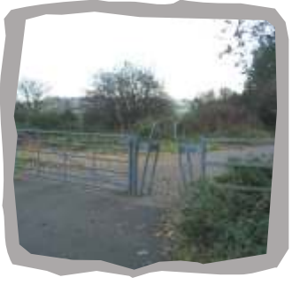
Gate towards Racecourse entrance (Waymarker 4)