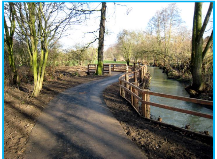
This is phase two, in Kettlethorpe, of the cycle paths that will link Pugneys Water Park to Newmillerdam.

Wakefield Metropolitan District Council continues to make progress, even if slowly, in improving the infrastructure for cyclists in the district. Below are two examples of new infrastructure in the last few months.