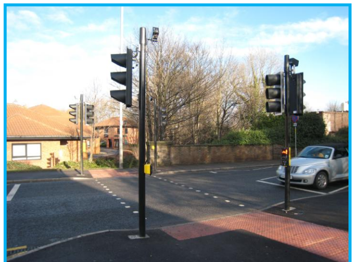
New toucan cycle crossing, A6186 Standbridge Lane, Wakefield.