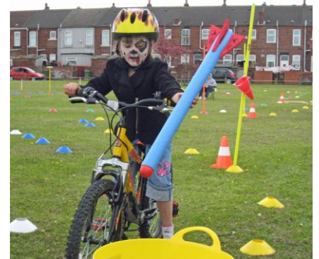
Having fun on the Cycle skills course at Kinsley