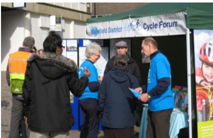
The forum information stall in the Cathedral precinct