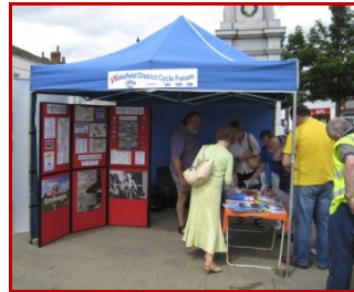
Pontefract Liquorice Festival