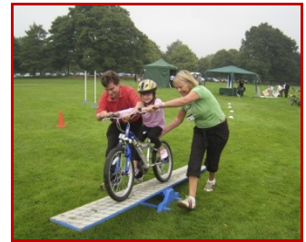
Obstacle course Nostell