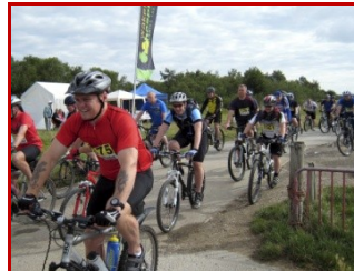
Hospice Bike Ride, Pugneys