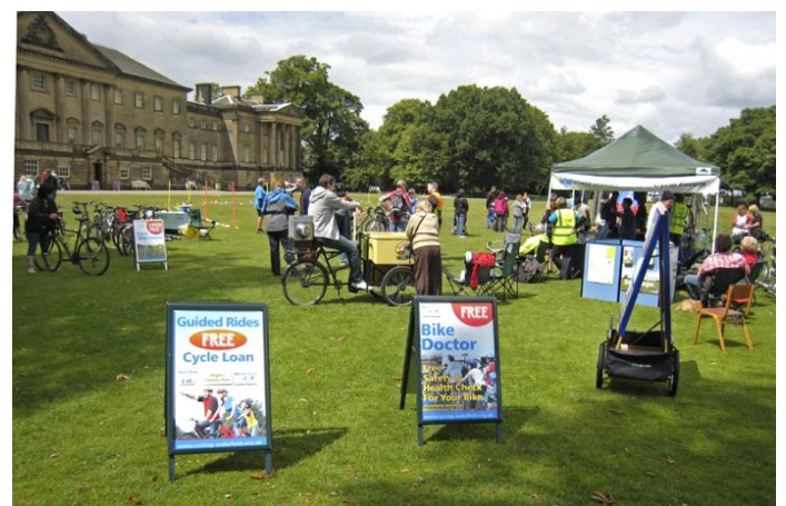
Enjoying an ice cream in the sunshine

Thanks are due to all of the volunteers who gave their time willingly. We have once again organised a Bike Week to be proud of. It was hard work but worth it. Next time let us make it even more impressive.