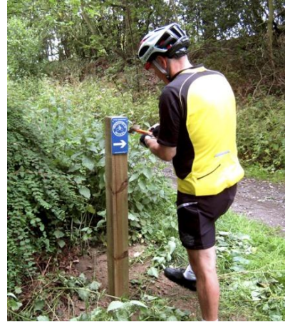
Des hammers it home

Hopefully this is only the first of many cycle routes that will result from co-operation between Forum and Council.