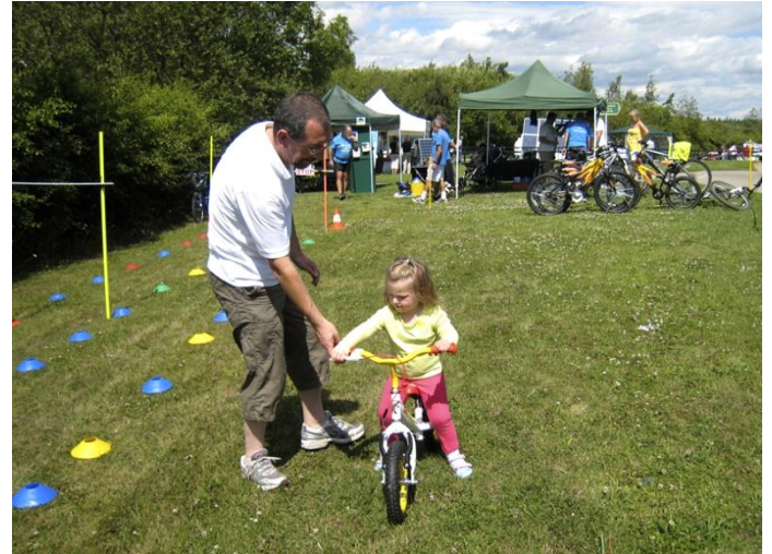
The youngest participant on the skill course at Anglers Green Living Day

Interestingly, even though it was a much lower key event than the weekend at Nostell, the final event of the week at Anglers Country Park Green Living Day proved a busy day for the bike doctor who checked and repaired over a dozen cycles throughout the day.