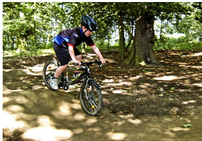
A young participant on the Pump Track

A fascinating array of bicycles was on display. Bygone Bikes provided an exhibition of vintage bicycles, including a Penny-farthing and a Boneshaker, which looked magnificent with the Priory as a backdrop to the display. At the other end of the spectrum, Wheels for All provided a selection of adapted cycles for people with disabilities and different needs. As you can see from the photo below of the day, the Forum Chair and Vice-chair were among the participants enjoying a ride on one of these bikes.