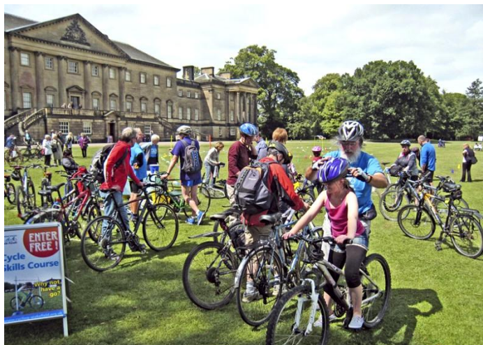
Getting ready for a guided ride

As usual the big event was at Nostell Priory and Parkland over the weekend of 18/19 June and as you can see from the photograph below it was a bright sunny weekend. Over 200 people took part in the events organised by the Forum, which included a cycle skills course and guided rides.