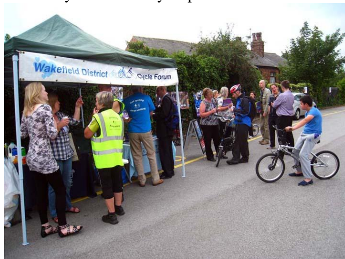
Commuters talk cycling with Forum volunteers

Agbrigg in Wakefield, which is ideally suited to combining rail and cycle as it has a new covered cycle parking facility and some lockable cycle parking, as well as being linked to Walton and Crofton by traffic-free cycle paths.