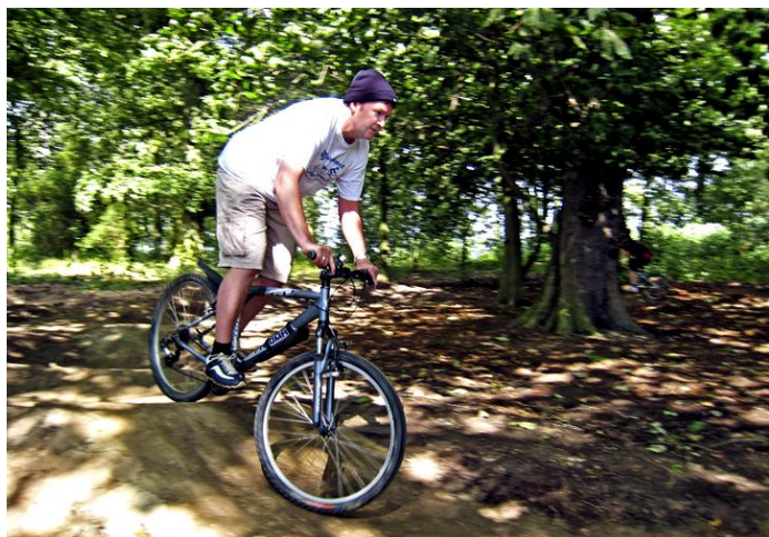
The 'bike doctor' has a go on the pump track

A new addition to the programme was the Pump Track which has recently been built in the woodlands within the Parkland. This is a small but challenging circular course where participants have to complete the circle without pedaling.