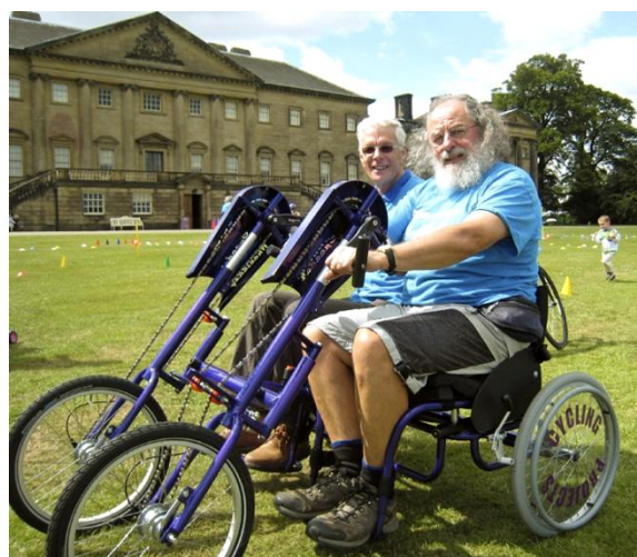
A great wee team

A fascinating array of bicycles was on display. Bygone Bikes provided an exhibition of vintage bicycles, including a Penny-farthing and a Boneshaker, which looked magnificent with the Priory as a backdrop to the display. At the other end of the spectrum, Wheels for All provided a selection of adapted cycles for people with disabilities and different needs. As you can see from the photo below of the day, the Forum Chair and Vice-chair were among the participants enjoying a ride on one of these bikes.